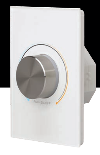
DGDALIDM8 for dimming and colour temperature control*