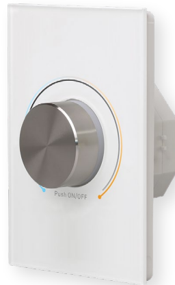
DGDALIDM8 for on/off switching, dimming and colour temperature control