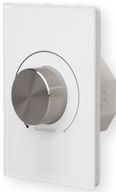
DGDALIDM for on/off switching and dimming control